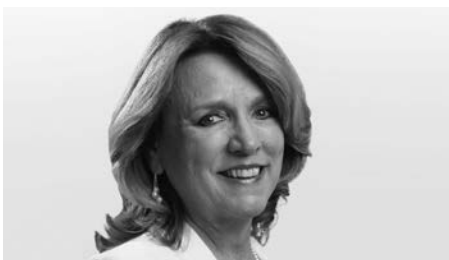
Deborah Lee James

Former Secretary of the Air Force, Senior Industry Executive, Board Member